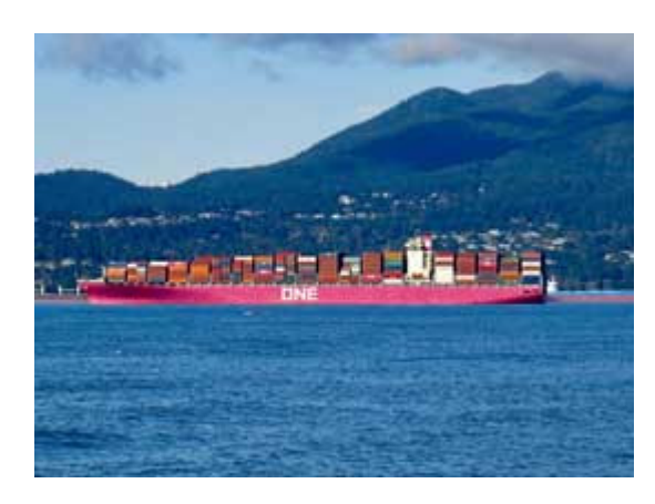
What's going on with inflation in Canada? Check in on which prices are actually rising, which aren't, and a few reasons why.