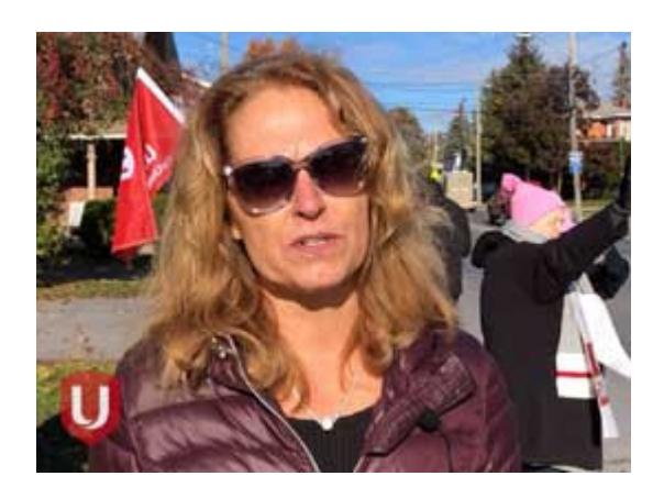
Shelter workers in Napanee are on strike against an employer that won't fill empty positions and refuses to match the language of a sister agency only 30 minutes away.