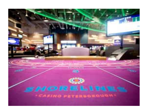
Workers at the Shorelines Casino in Peterborough have voted overwhelmingly to join Unifor.